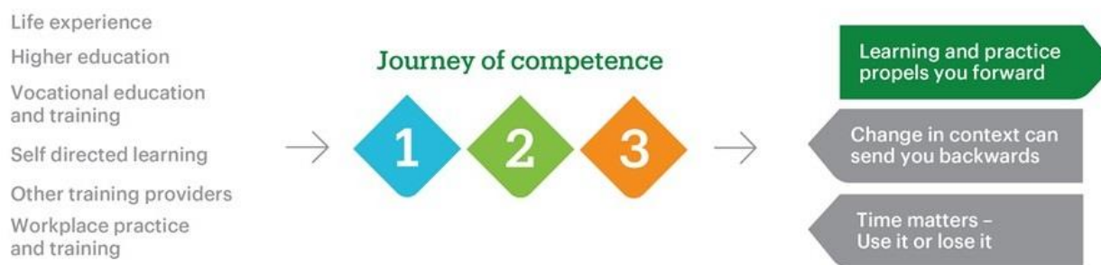
Skills Impact simplified representation of the Journey of Competence