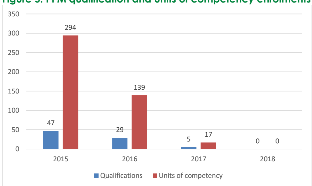
Figure 5: PPM qualification and units of competency enrolments

The Pulp and Paper Manufacturing Industry is currently without an RTO able and willing to deliver the PPM Training Package. Consequently, there were zero enrolments in PPM qualifications in 2018. Figure 5 demonstrates that, when RTOs had the Training Package on scope, there was demand for training; however, as RTOs ceased delivering training, there was a notable – and unavoidable – drop in enrolments.